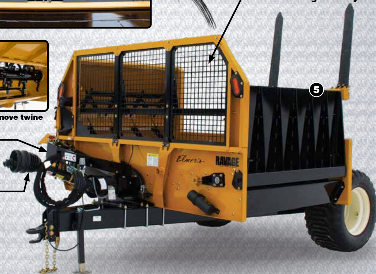
Industry Leading Bale and Loading Visibility